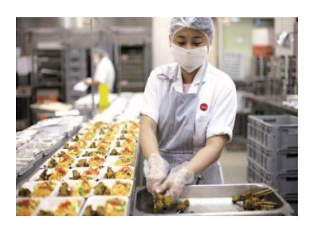
The "Life + Zero Cabin Waste" Plan

Pre-ordered meals offer many benefits for aviation businesses including lowered costs and weight on board, which also decreases fuel consumption.